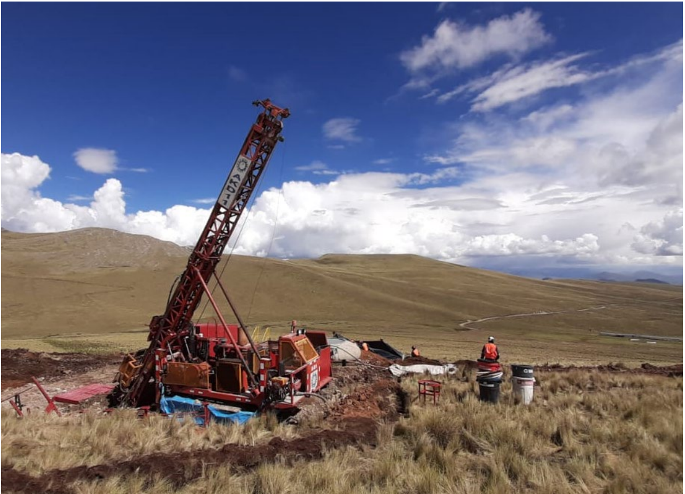
Figure 1: Photograph of the rig positioned on the first drill platform at Montaña de Cobre Zone

At Montaña de Cobre, historic drill hole (H-10) also intersected a gold mineralized quartz vein with typical epithermal textures that returned 1.23m at 27.1g/t Au 1 from 210.9m. The current drilling campaign is designed to cross epithermal style veins whilst also testing the copper-gold skarns.